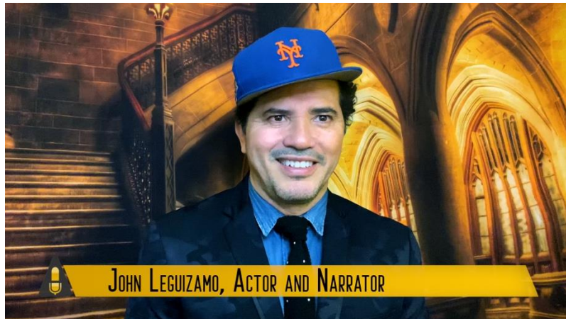
John Leguizamo, 2021 Audie Awards emcee

the page.” Jerry Craft stated: “I had the biggest emotional attachment to this book and its characters. Obviously, no one knows the characters like the author, but fortunately Elizabeth Acevedo has the skills to say the lines exactly as she had written them. I would definitely recommend this title. It flows so well.”